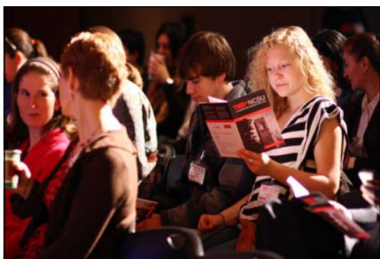
The audience prepares for the start of a TEDxNCSU session.