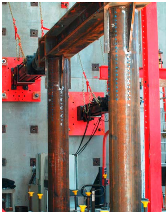
Seismic Testing of Steel Bridge Bent for Alaska DOT