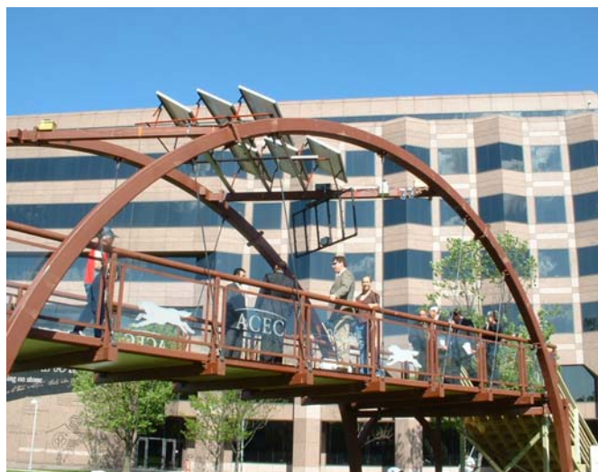
Pedestrian bridge in downtown Raleigh designed and built by NCSU students. Received the first-place award from the NC Chapter of ACEC (American Council of Engineering Companies).