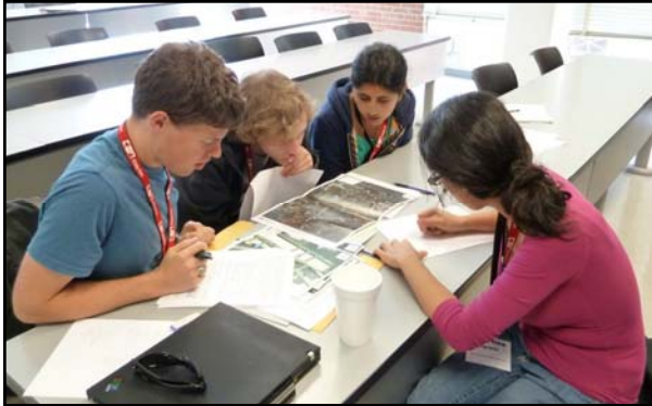
The winning team at work

The student teams worked throughout the weekend in Mann Hall. Saturday morning began with breakfast provided by KHA. KHA staff answered questions and mentored the teams throughout the day. Teams were on their own Saturday night and Sunday morning as they put the finishing touches on their proposals and presentations. Sunday lunch was provided by KHA to the teams and an evaluation committee of practicing engineers. On Sunday afternoon, the evaluation committee listened to the team reports and reviewed their proposals.