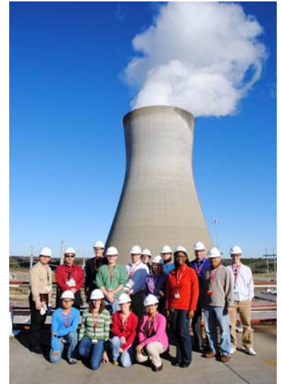
Members of the student chapter visit Shearon Harris nuclear power plant near Raleigh, NC.