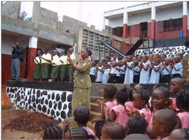
Students at the Village Learning Center in Lower Allentown, Sierra Leone