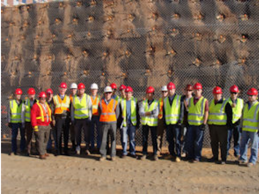
CE 549 students by the soil nail wall

NC State's Centennial Campus is a hotbed of construction activities. Thus, it provides a real-world laboratory for students in the geotechnical program to observe first hand the key challenges of preparing a new site for a major building project.